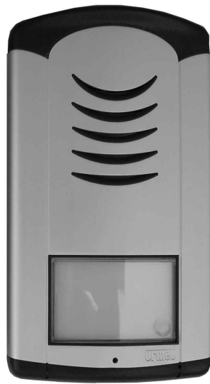
Single button no camera