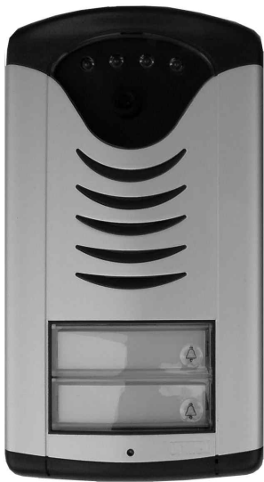
Twin button with camera

The ProTalk IP Door Entry Systems are based around a slimline SIP door phone which registers as an extension to any SIP based phone system. Callers at your door can talk to you whether you are on site or not. The camera option shows real-time video on either a computer or Snom 800 series SIP telephone. ProTalk also offers a range of supporting kits to implement or enhance full door entry control including magnetic locks, battery backups or keyfob entry.