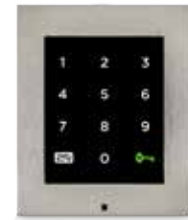
2N® ACCESS UNIT KEYPAD