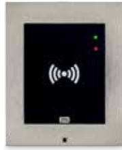
2N® ACCESS UNIT RFID

ord. 916009 (125kHz) ord. 916010 (13.56MHz)