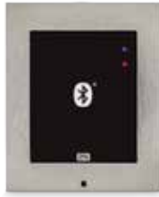
2N® ACCESS UNIT BLUETOOTH

ord. 916009 (125kHz) ord. 916010 (13.56MHz)