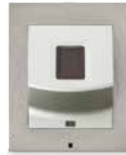
2N® ACCESS UNIT FINGERPRINT READER