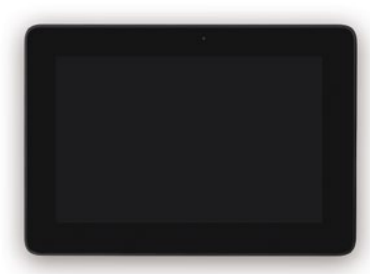
Maxwell 10S Main Device S30853-H4006-R101