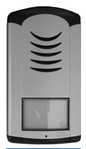
Twin button with camera