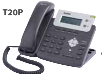
2 x VoIP User Accounts & 2 Line Keys 2 x 16 Line LCD

Call Hold, Call Waiting, Call Transfer, Call Forward Caller ID, Call List, DND, Redial, Flash, 3-way Conference, Speed Dial, Personal Ring Tone, Voicemail, Volume Adjustment, Mute, Dial Plan, Dial-now, Paging, Call Park, Call Pick-up, Distinctive Ringtone, Auto-Answer, Intercom