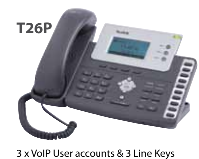
13 programmable keys with LED indication 3 indication LED Busy Lamp Field (BLF) Shared Bridged Appearance (BLA) Expansion Model Support