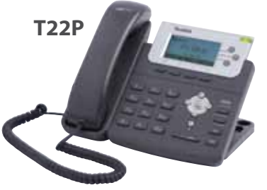
3 x VoIP User Accounts & 3 Line Keys 3 programmable keys LCD 132 x 64 pixel with white backlit display Language customisation support