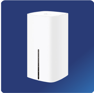
TP-Link NX510v Router