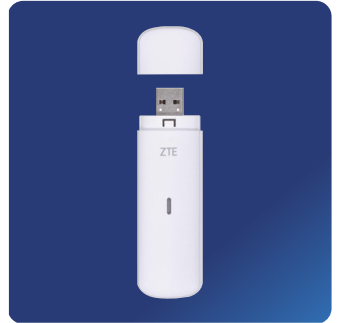
ZTE 4G USB Dongle