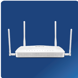
DrayTek Vigor C410ax / C510ax