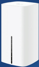
TP-Link NX510v Router