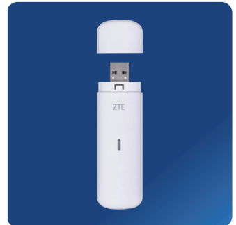
ZTE 4G USB Dongle