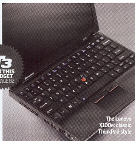
The Lenovo X100e: classic ThinkPad style

The Edge employs the same spill-resistant keyboard as its ThinkPad predecessors but also includes a multi-gesture touchpad so you can utilise Windows 7's interactive features.