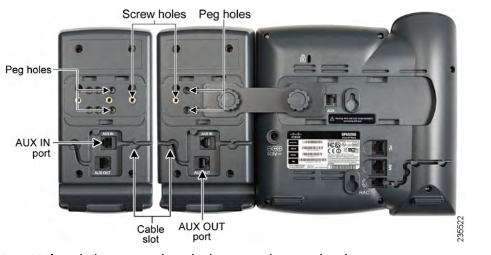
STEP 11 Attach the appropriate desktop stands to each unit.