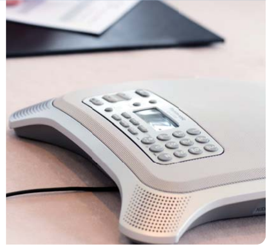
KX-NT700 IP CONFERENCE SYSTEM V2.0 BROCHURE