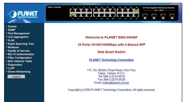
Figure 2. Web Main Screen of GSW-2404SF

After entering the password (default password is "admin") in login screen (Figure 1 appears). The Web main screen appears as Figure 2.