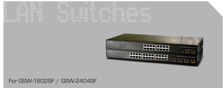
For GSW-1602SF / GSW-2404SF