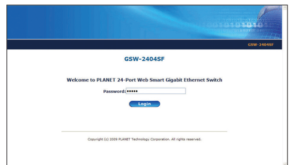
Figure 1. Web Login Screen of GSW-2404SF

After entering the password (default password is "admin") in login screen (Figure 1 appears). The Web main screen appears as Figure 2.