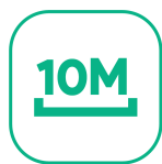
10m Pick-up Range