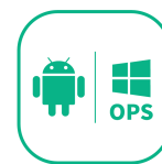
Android or Windows