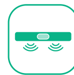
4 * Speakers with Stereo Sound