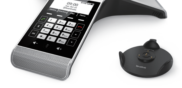
Hybrid UC meeting